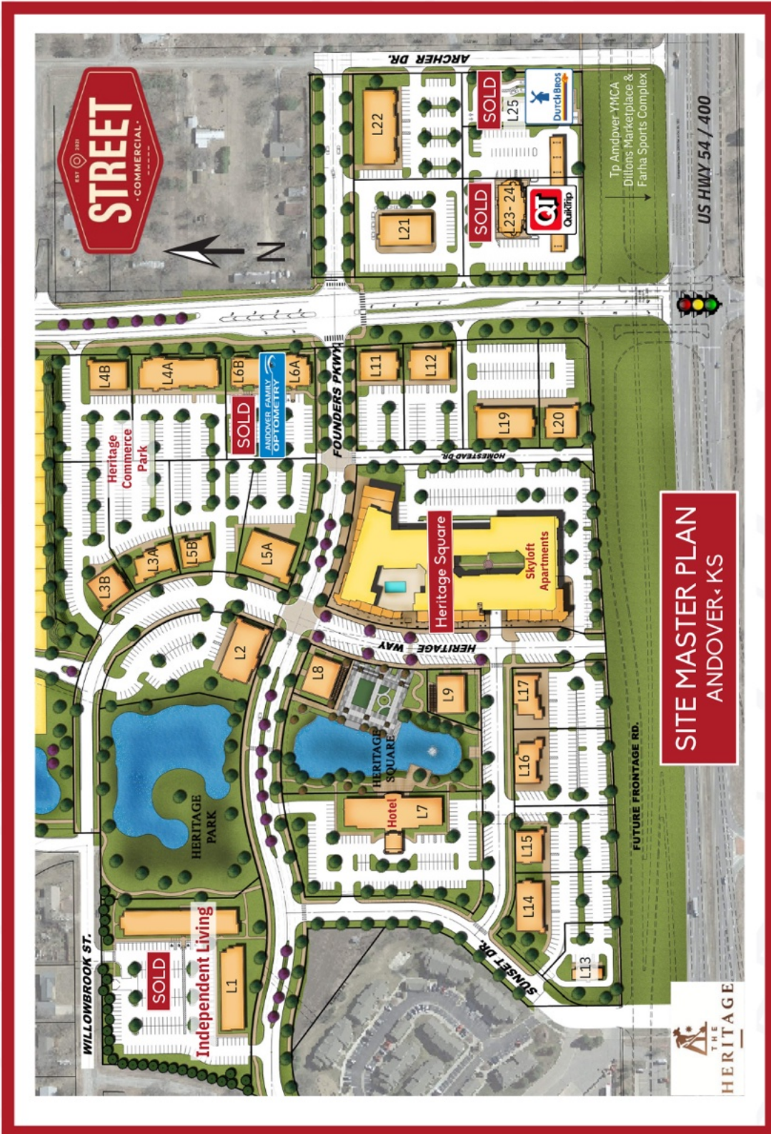
SITE MASTER PLAN ANDOVER, KS